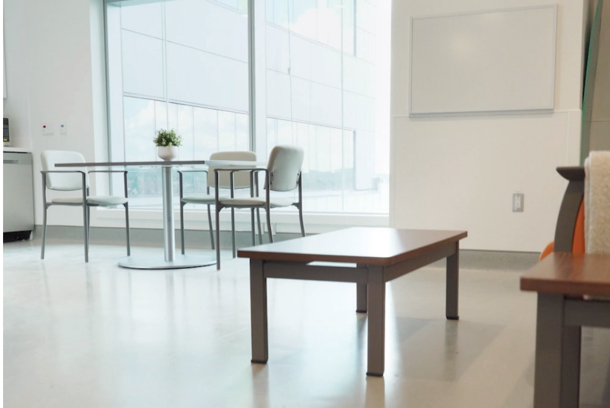
A look inside the Activities of Daily Living Suite in the Sorbara Integrated Stroke Unit.