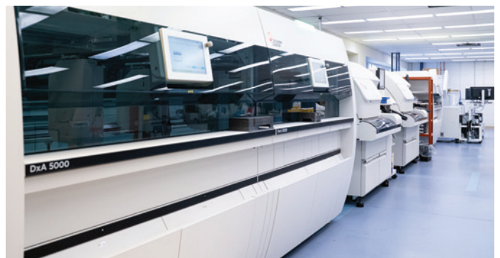
The new automated chemistry and hematology track at Mackenzie Richmond Hill Hospital.