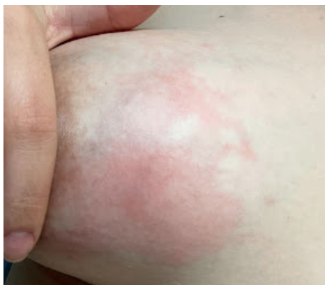
Early days of mastitis. Warm, hard, red, splotchy streaks.

Remember that mastitis is treatable at all stages. Contact a La Leche League Leader or your healthcare provider if you suspect inflammation in your breast.