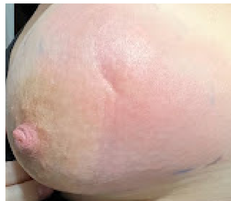
Even worse. An abscess has formed a lump which is protruding from the already swollen breast tissue in upper middle section of the photo.