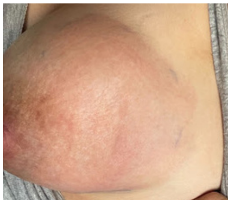
Getting worse. Warm, hard, red, and swollen.