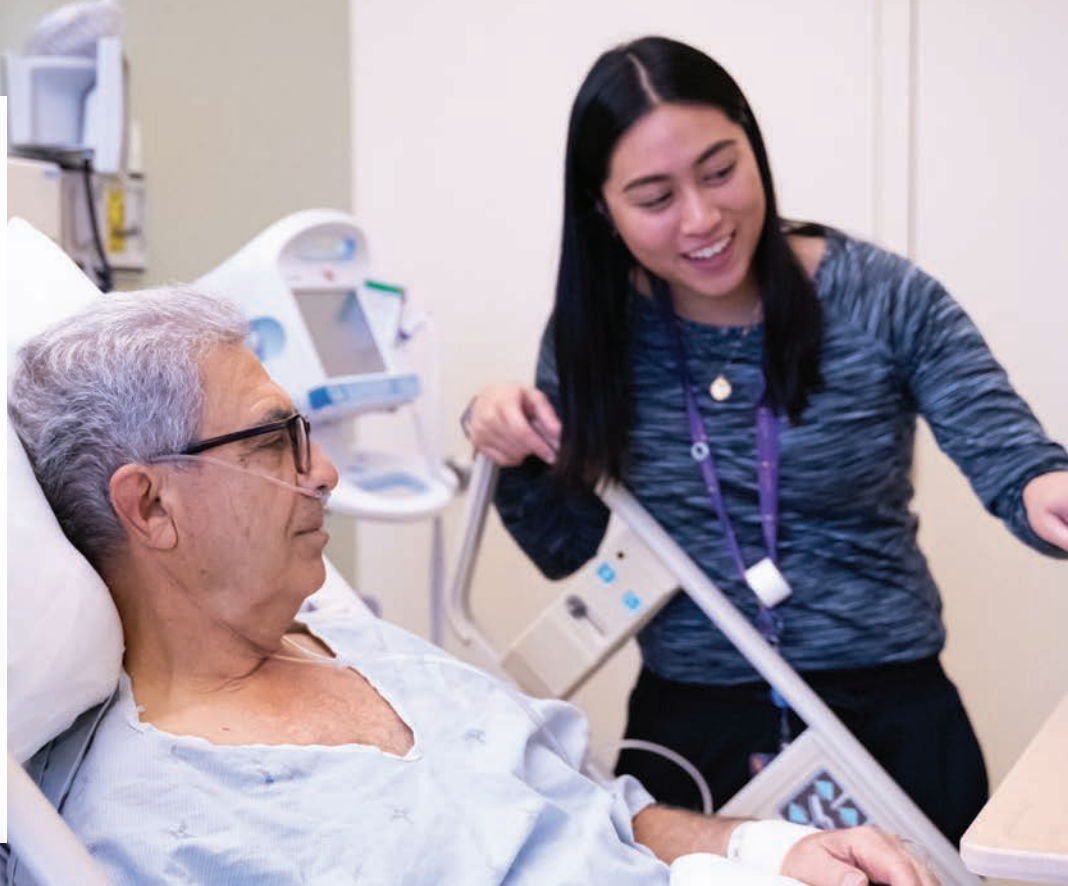
A patient in our surgery unit at Mackenzie Richmond Hill Hospital tests MyCare bedside technology before it's introduced at Mackenzie Vaughan Hospital.

At this time next year, Mackenzie Vaughan Hospital will be up and running. The new hospital will double our community's access to the ultimate in care. As some of our most recent milestones prove, we are enhancing care today at Mackenzie Richmond Hill Hospital and preparing for our tech-enabled future.