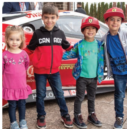
Drivers-in-training at the 15th Annual Ferrari Rally of Ontario on October 6, 2019.