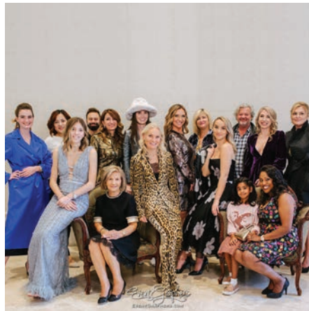
Beautiful models from the Mother-Daughter Fashion Show at Joy of Aging, many of whom are long-standing champions of Mackenzie Health Foundation.