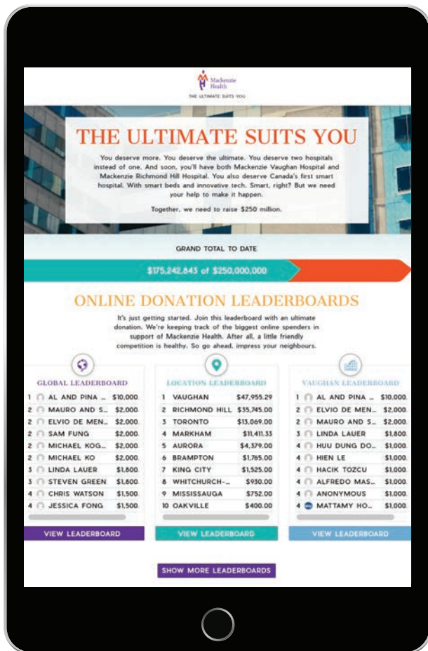
Your friends, family members, colleagues and neighbours are on the Ultimate leaderboard. Are you?