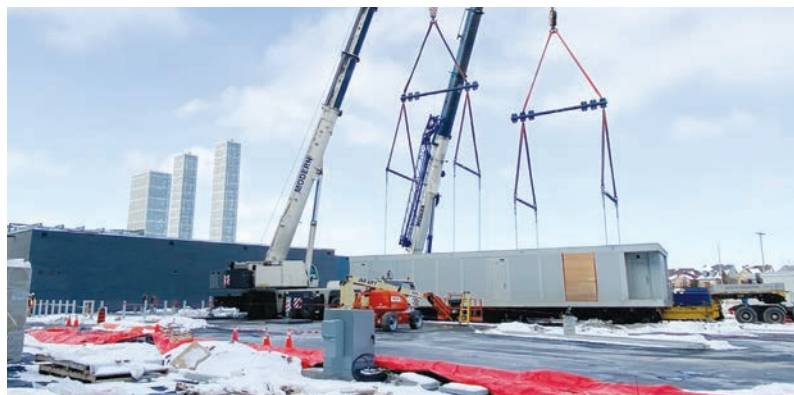
Cranes place the modular data centres beside the Central Utility Plant (CUP) at Mackenzie Vaughan Hospital.

The 150,000 lb prefabricated modular data centres were designed, manufactured, configured and tested at a factory near Windsor and installed by cranes at the Mackenzie Vaughan Hospital site. A similar